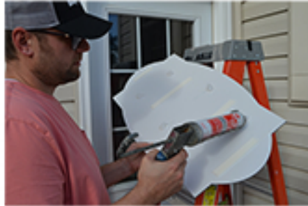
5. Apply supplied adhesive in uniform dots. The dots must be higher/thicker than the tape.