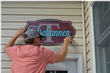
7. Line up your reference marks.