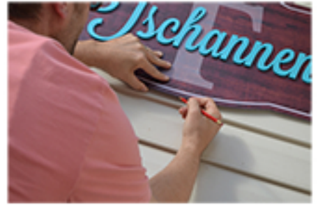
3. Mark a corresponding reference mark to the location your sign will be applied. Use a level and make additional guide lines to substrate.