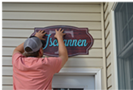
8. Press the sign firmly to the wall. Do not apply pressure until your reference marks all line up and you like the positioning. You have one chance!