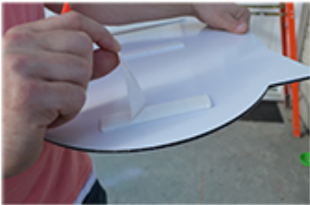
4. Remove backing paper on the adhesive tape.