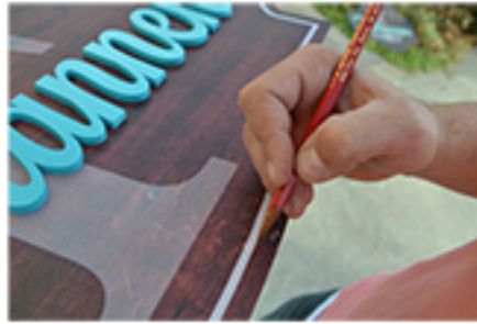
2. Mark the center point of your sign with tape or pencil.