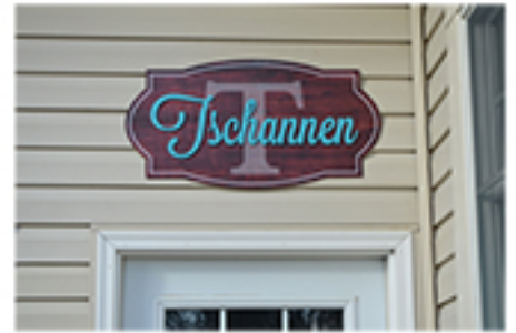
9. Step back and enjoy!

DISPLAY CRAFT SIGNS ASSUMES NO LIABILITY, AND PROVIDES NO WARRANTY ON THE INSTALLATION OF YOUR SIGN. OUR SYSTEM IS A SUGGESTED METHOD FOR A SEAMLESS INSTALLATION, BUT NOTHING....WE MEAN NOTHING....BEATS A FASTNER (SCREW, NAIL, ETC.)