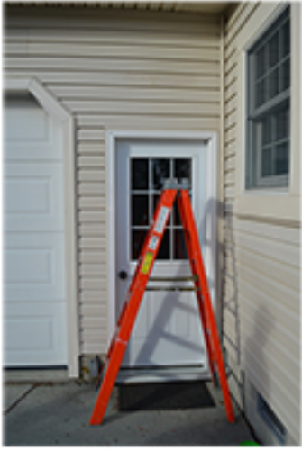
1. Get your tools ready.